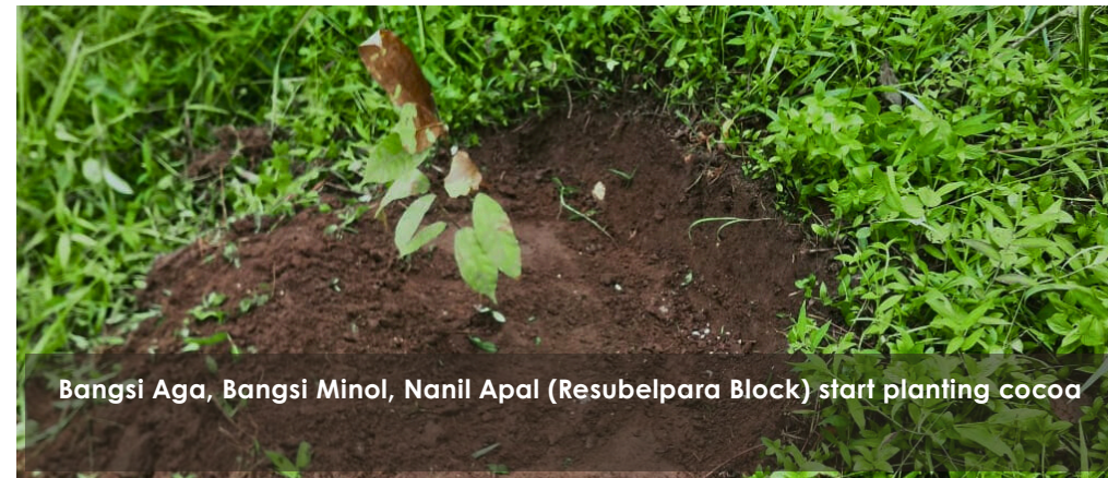
Bangsi Aga, Bangsi Minol, Nanil Apal (Resubelpara Block) start planting cocoa