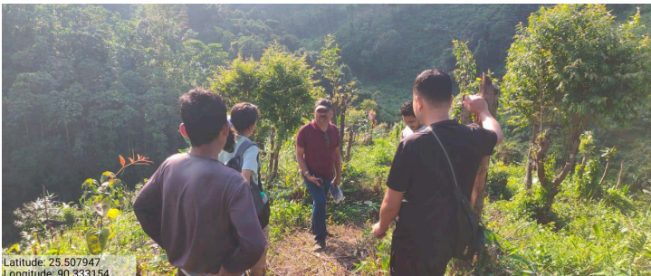
Site Inspection to Advance Soil and Water Conservation Interventions