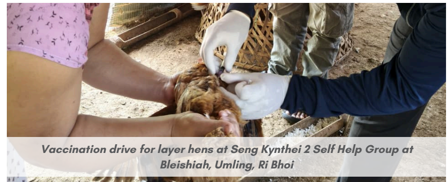
Vaccination drive for layer hens at Seng Kynthei 2 Self Help Group at Bleishiah, Umling, Ri Bhoi

On 7th May 2026, a bamboo rhizome plantation activity was carried out under Umsning Block as part of ongoing efforts to promote sustainable land development and environmental restoration. The initiative aims to strengthen green cover, support livelihood opportunities and encourage community participation in sustainable plantation practices.