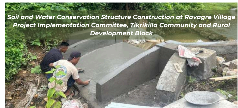
Soil and Water Conservation Structure Construction at Ravagre Village Project Implementation Committee, Tikrikilla Community and Rural Development Block

The team interacted with Village Project Implementation Committees, Self Help Groups, plantation beneficiaries, and community members involved in springshed management and bamboo based livelihood activities. The visit provided an opportunity to review progress, discuss implementation challenges, and assess community led efforts to improve natural resource management and strengthen sustainable livelihood opportunities.